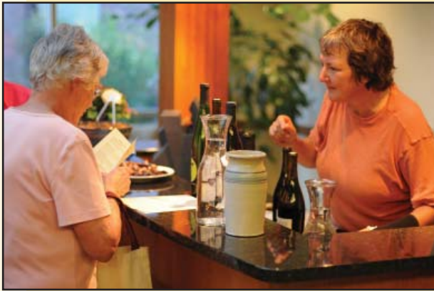
Airlie Vineyards holds a tasting in the new wine bar.